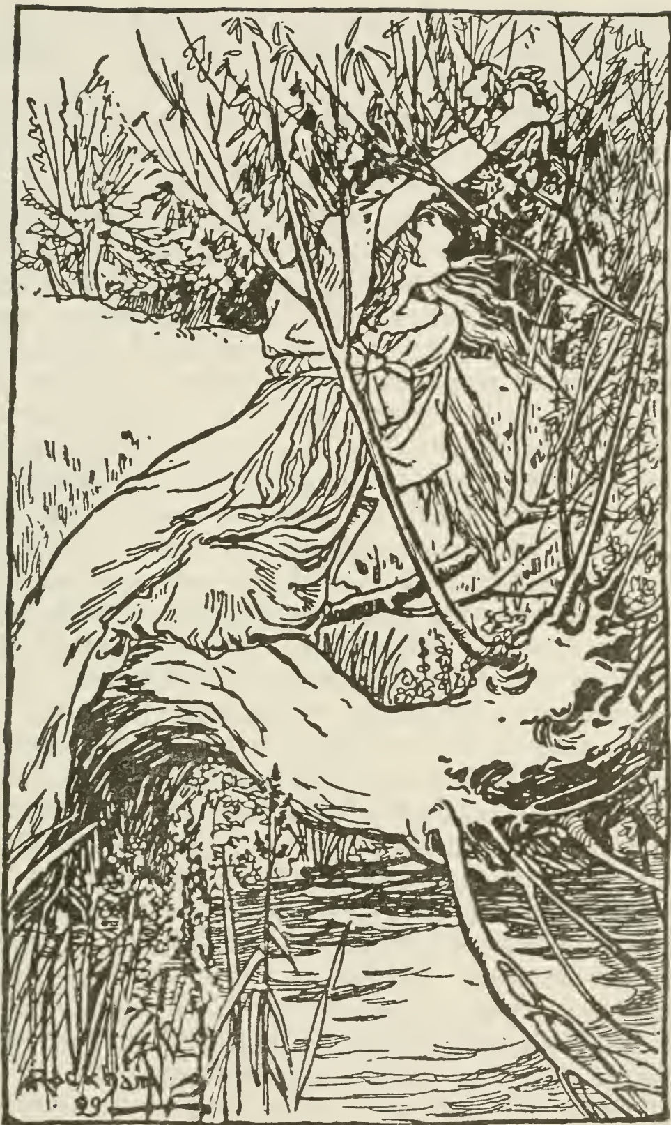
To this brook Ophelia came one day when she was unwatched