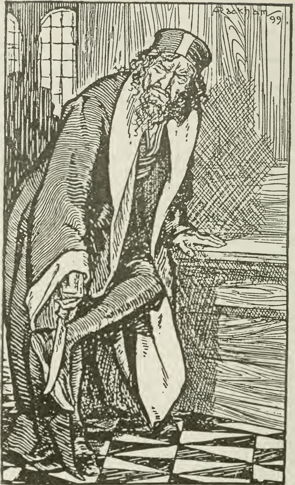
Shylock was sharpening a long knife