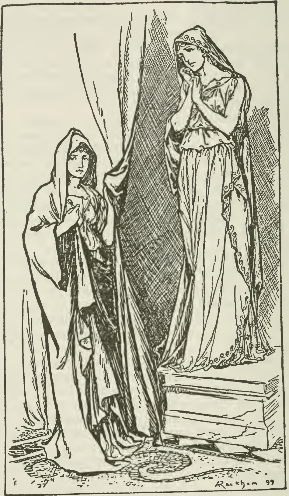
When Paulina drew back the curtain which concealed the famous statue