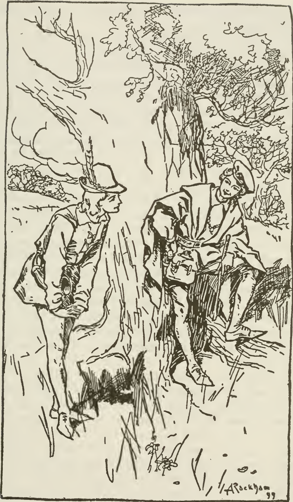
Ganymede assumed the forward manners often seen in youths when they are between boys and men