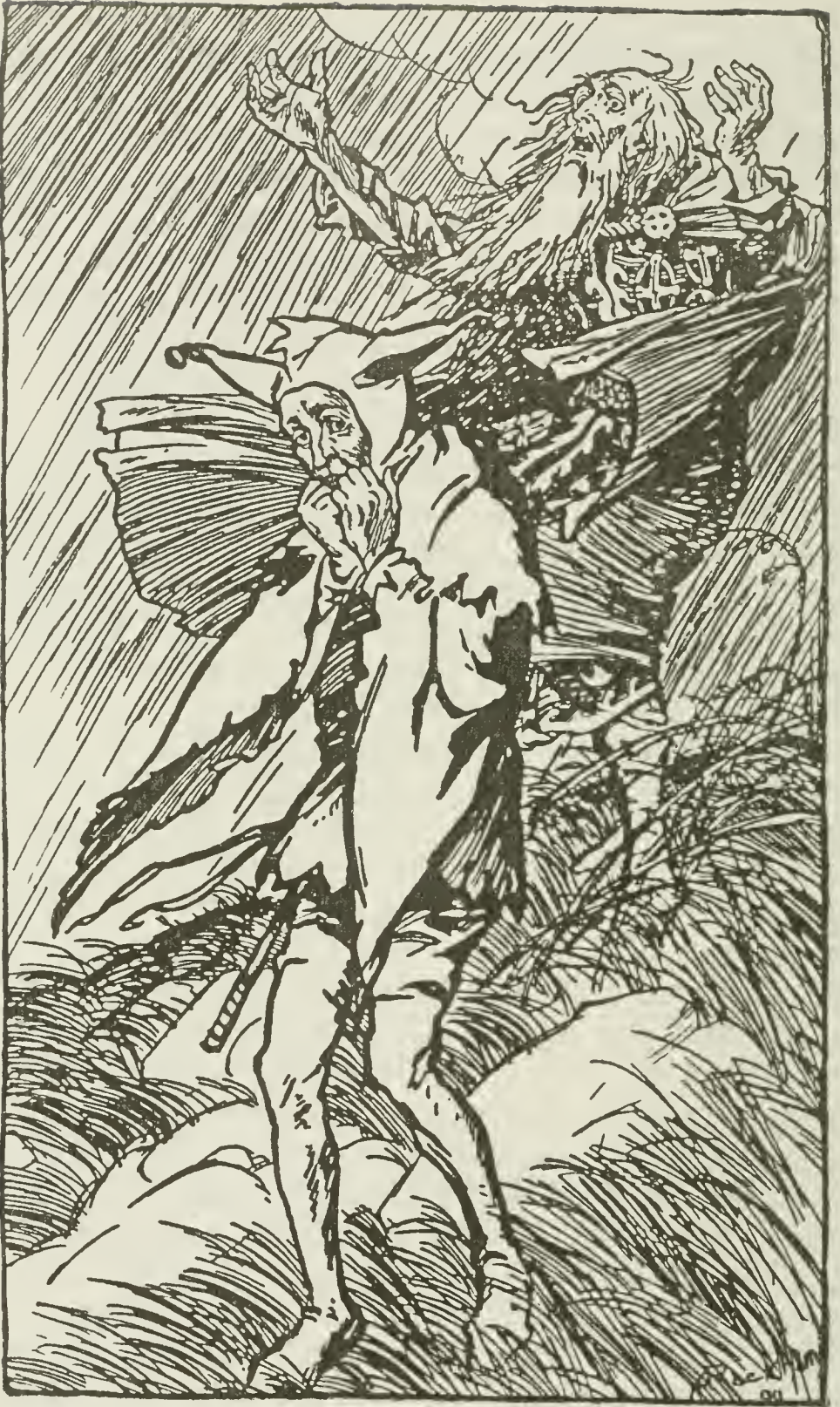
There upon a heath, exposed to the fury of the storm on a dark night, did King Lear wander out