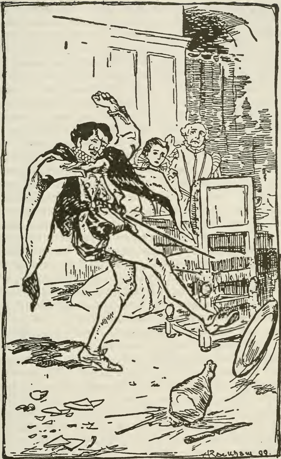
Petruchio, pretending to find fault with every dish, threw the meat about the floor