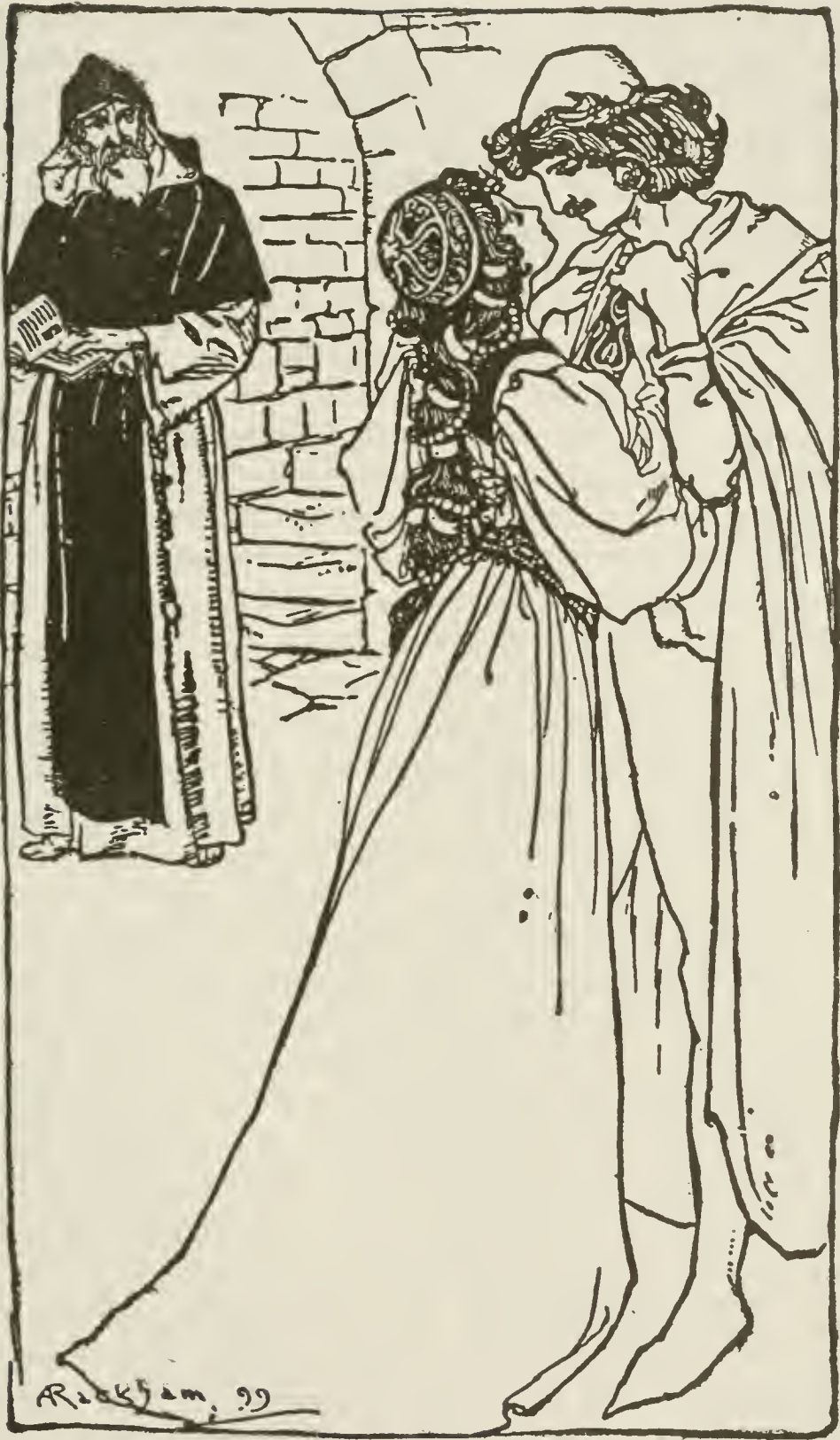
At the cell of Friar Lawrence